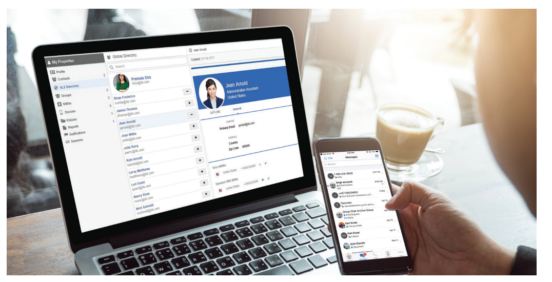
Seamless and secure from mobile to desktop. Access CellTrust SL2 via browser on any device for both messaging and calling. You can use one device to send and another to respond simultaneously.

CellTrust SL2<sup>™</sup> is integrated with Microsoft Intune to separate personal and business communication via a Mobile Business Number<sup>™</sup> (MBN) to provide a compliant mobile device solution, manage cybersecurity across their mobile device network and avoid data loss. SL2 provides enterprise level compliance enablement and recordkeeping for BYOD/COPE within the highly regulated financial services, government and healthcare industries. SL2 operates in the Microsoft Intune container on IOS<sup>®</sup> and Android<sup>®</sup> utilizing customized features to allow organizations to tailor it based on their industry needs.