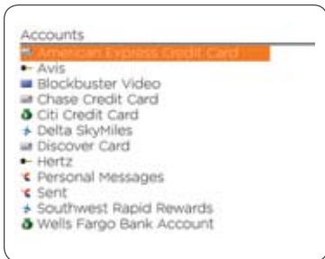
Screen Shot 1: Easily access your personal account information via the CELLTRUST WALLET "Accounts" screen on your cell phone.

Most people understand that using a next-generation mobile wallet without thinking through today's security consequences like identity theft and fraud is a risk. Moreover, the U.S. Federal Trade Commission reports that millions of Americans each year are at risk of having their identities stolen. Architected by a leading team of IT security engineers, CellTrust Wallet was designed with today's requisite security standards and features to bring peace of mind to the mobile community. Built on an advanced Secure Mobile Information Management™ (SMIM) platform, CellTrust Wallet and its security-centric feature-set ensures safe and flexible management of life and commerce information anywhere, anytime.