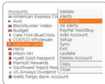
Screen Shot 2: Upon accessing a particular account, quickly and securely check details, receive alerts, manage activities, and more.

CellTrust Wallet allows the consumer to vigilantly monitor all banking and credit card activities detecting and proactively reporting on fraudulent activities before they spiral out of control. Moreover, the consumer can manage all types of personal account information using just a mobile device anytime, anywhere and experience the ease of automatic updates via CellTrust without additional interaction. By integrating with leading online payment providers such as PayPal Mobile and others, consumers now have the option of making payments or purchases or money transfers simply and easily with their cell phone.